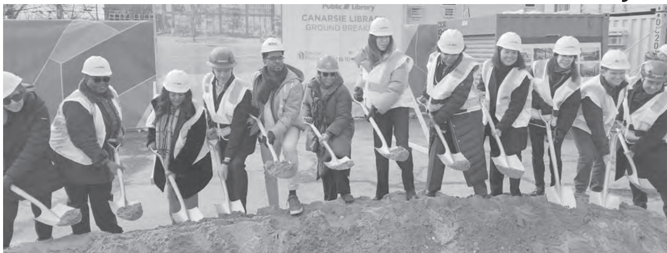
Breaking ground at site of new Canarsie Library.

A spokesperson for Shawmut said construction is expected to be completed in 21 months.