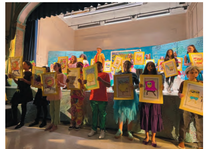
SpongeBob is more than just a simple sponge; he is adored throughout the years.