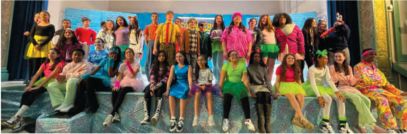
The cast of P.S. 207's production of The SpongeBob Musical.

Families, classmates and faculty staff members headed to the auditorium of P.S. 207 Elizabeth G. Leary, located at 4011 Fillmore Avenue, on Wednesday evening, February 4th, for a performance of the Fillmore Academy Drama Club's first play of 2026, The SpongeBob Musical .