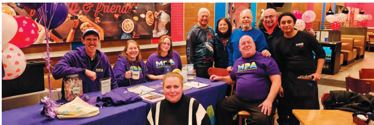
Marine Park Alliance members pose with IHOP staff.