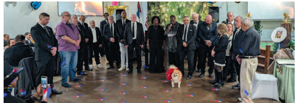
The Annual Installation of Officers at the Midget Squadron Yacht Club.

The Midget Squadron Yacht Club is located at the foot of Seaview Avenue and Paerdegat Avenue North.