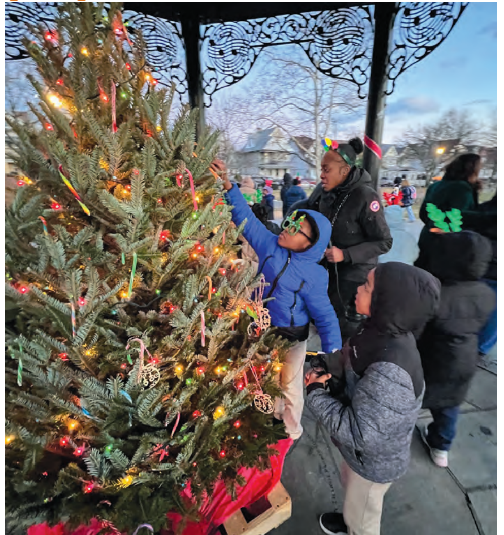
Having fun decorating the tree.