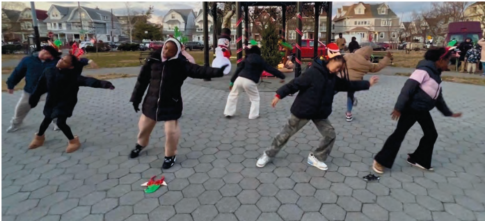
P.S. 119 dance performance.

In spite of the cold, it was heartwarming for the community to watch the children sing and dance. After the countdown, everyone cheered to see the tree light up that day to welcome in the season and to wish everyone a happy holiday.