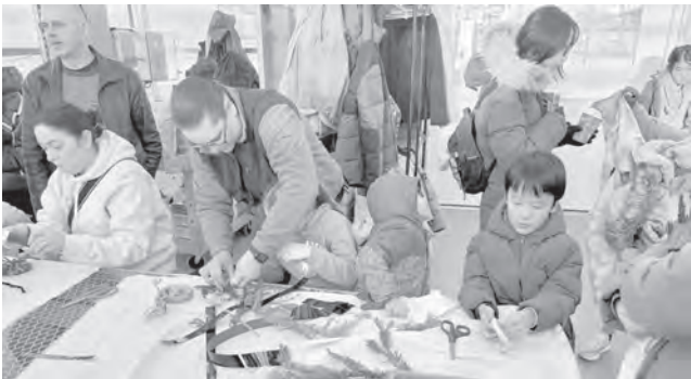
Families craft festive wreaths together.

place. Families were invited to make their own lip balm blends, using essential oils and dried herbs. They also had the opportunity to craft their own teas, using dried lemon balm, rosemary and hibiscus. After breaking the leaves down with a mortar and pestle, kids helped to fill paper tea bags to take home. There was also a festive wreath-making station, where kids could wrap wood rings with ribbon and adorn with evergreen, pine cones and other embellishments. "I love this farm, Mom; let's live on a farm," one excited child pleaded, a sentiment shared by many, as several parents could be heard trying to convince their youngsters to say goodbye to the farm and head home.