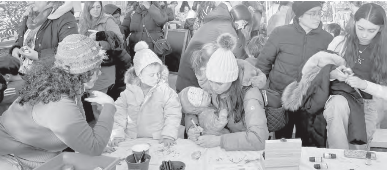
Families learn to blend their own lip balm.