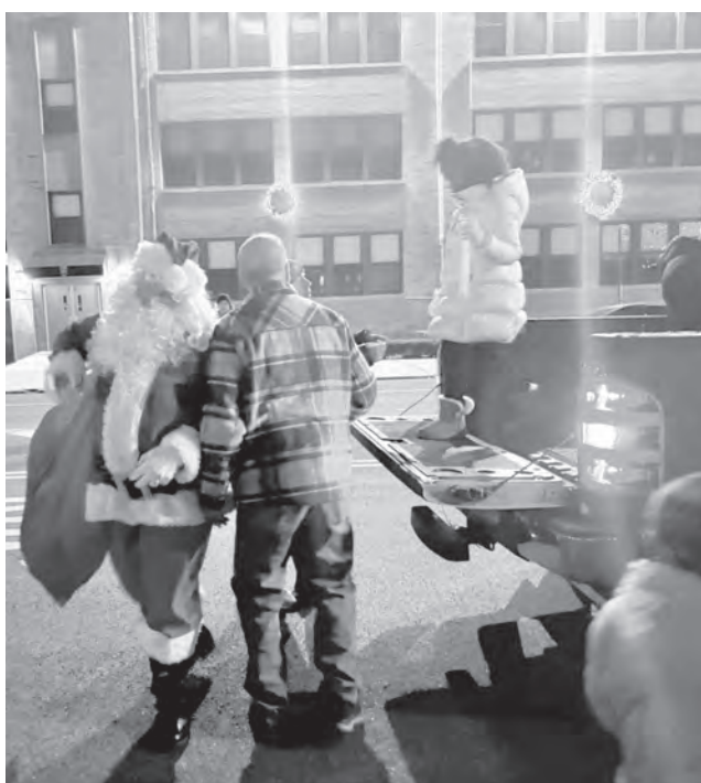
Santa arrives via pickup truck.