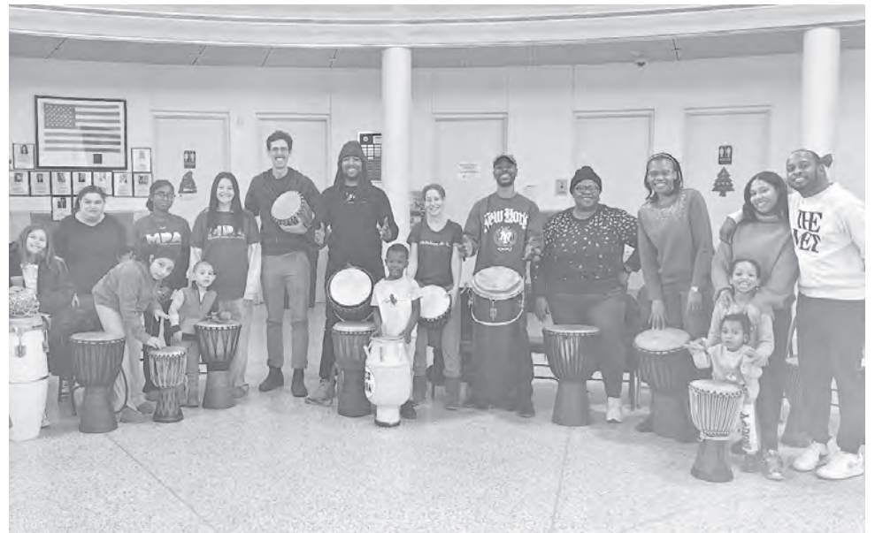
Families in attendance at MPA's Festival of Lights Kwanzaa Drumming program at the Carmine Carro Community Center.

Original The Original Pizza of Ave L Inc. of Canarsie