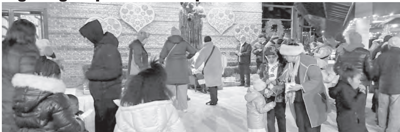
Families line up to take photos with Santa.