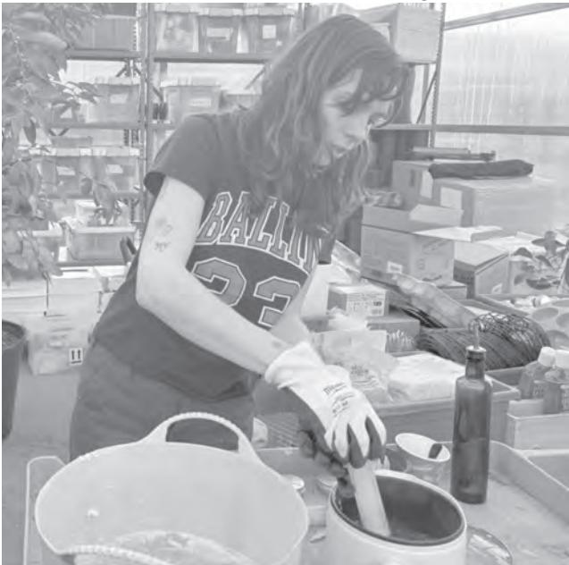
A member of the farm staff filling tins with piping hot lip balm mixture.