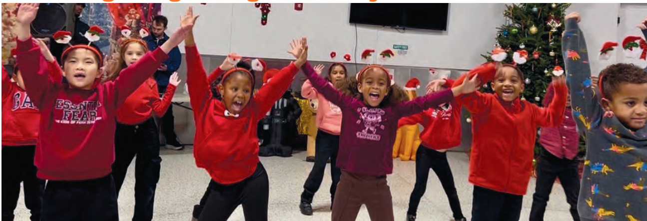
Moving and grooving to some holiday beats.