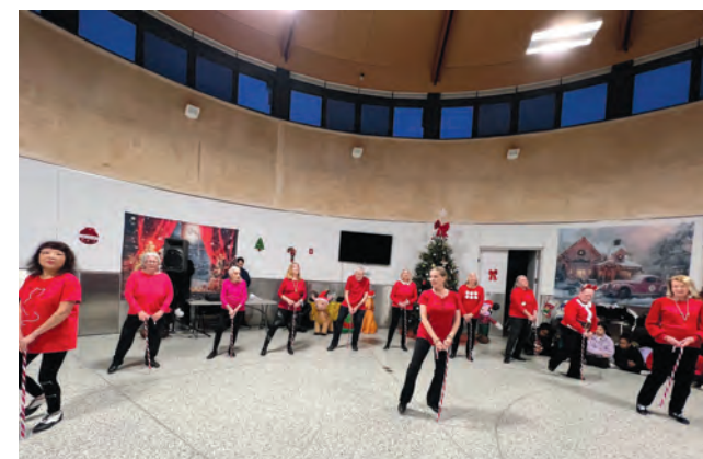
Marine Park Older Adults also gave several entertaining performances.

The event was held in partnership with Millennium Development, Marine Park Alliance, Marine Park Community Association, 63rd Precinct, NYC Department of the Aging, NYC Parks, Community Board 18 and the NYC Department of Youth and Community Development.