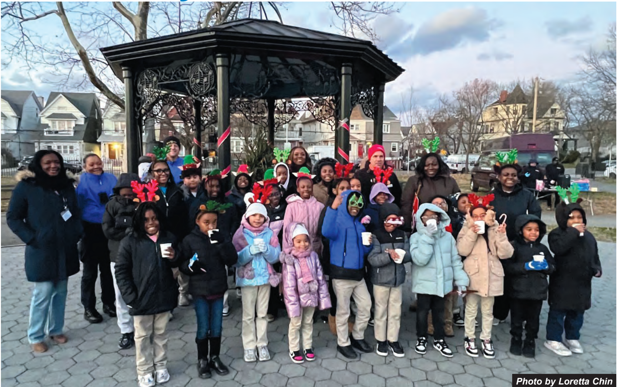
Story on page 4

Our office will be closed Thursday, December 25th, in observance of Christmas