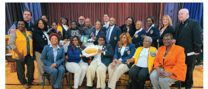
Brooklyn Canarsie Lions, clergy and elected officials.

In keeping with the Lions' commitment to addressing food insecurity in their communities, refreshments were served at the end of the Brotherhood Service. Hampers containing juice, non-perishable food items and a fresh turkey or chicken were also distributed. Hunger is one of five areas of service on which Lions are focused.