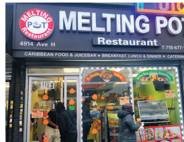
Melting Pot Restaurant, located at 4914 Avenue H.