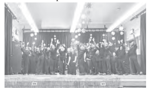
P.S. 115 Falcon Steppers