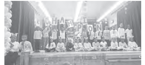
Champion – Class 202