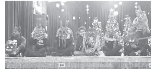
Mask Presentation – Class 204