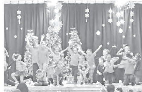
Jingle Bells – Class 201