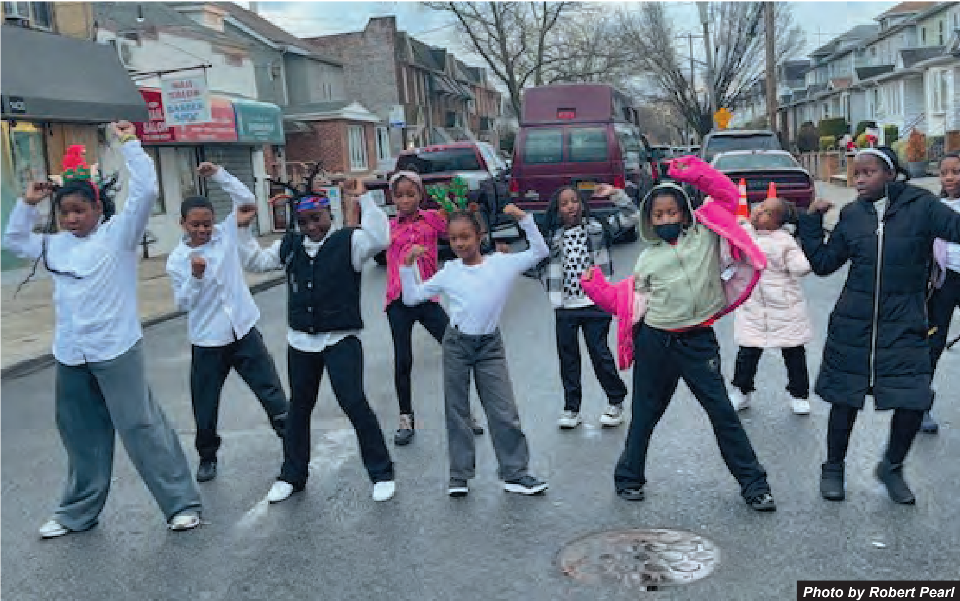
Story on page 8

Our office will be closed Thursday, January 1st, in observance of New Year Day