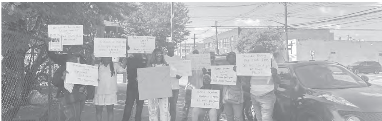
Customers protest across the street from Trinbago Express Shipping.