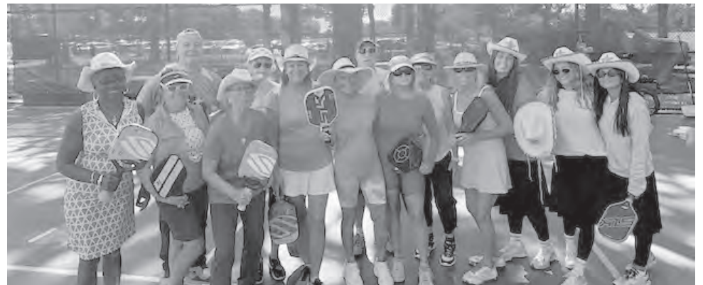
Dancers pose for a group shot.

"In 2023, Parks converted some tennis courts at Marine Park into eight pickleball courts, adding new sports coating and net posts. While the courts are mainly in good condition, there are some patches of peeling paint on three of