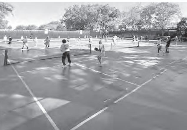
Pickleball players enjoying the game.