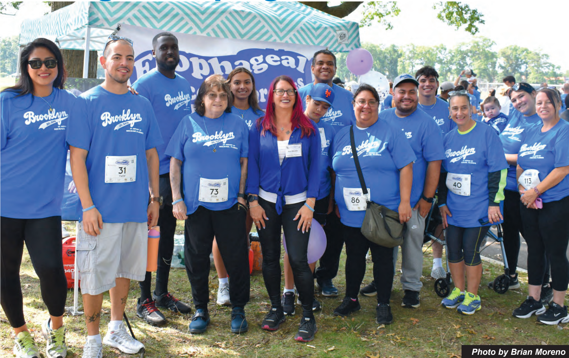
Story on page 14