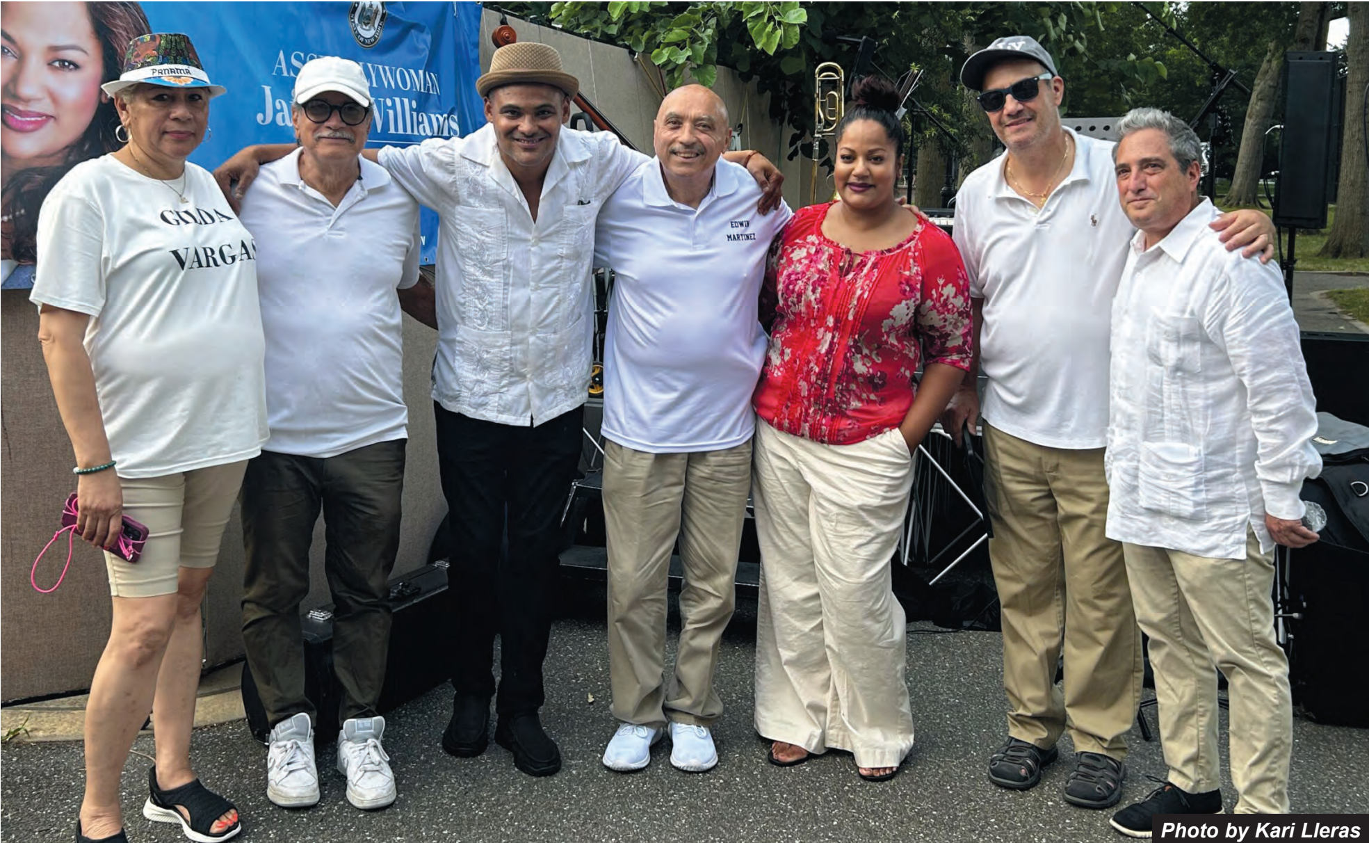
Story on page 14