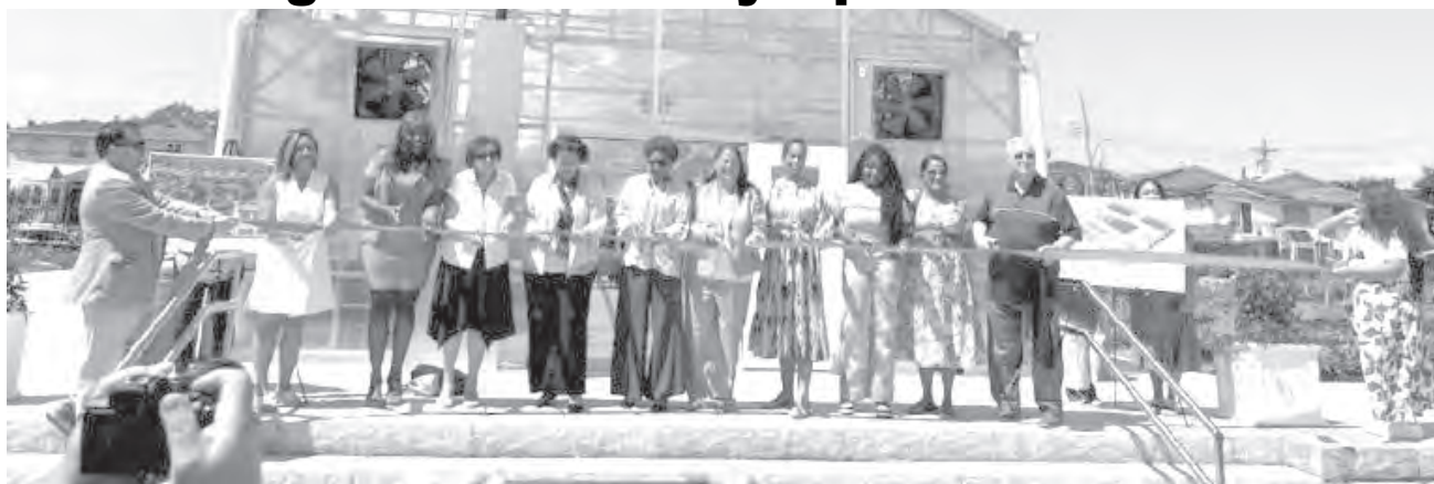
The ribbon-cutting ceremony marked the official opening of the learning farm.