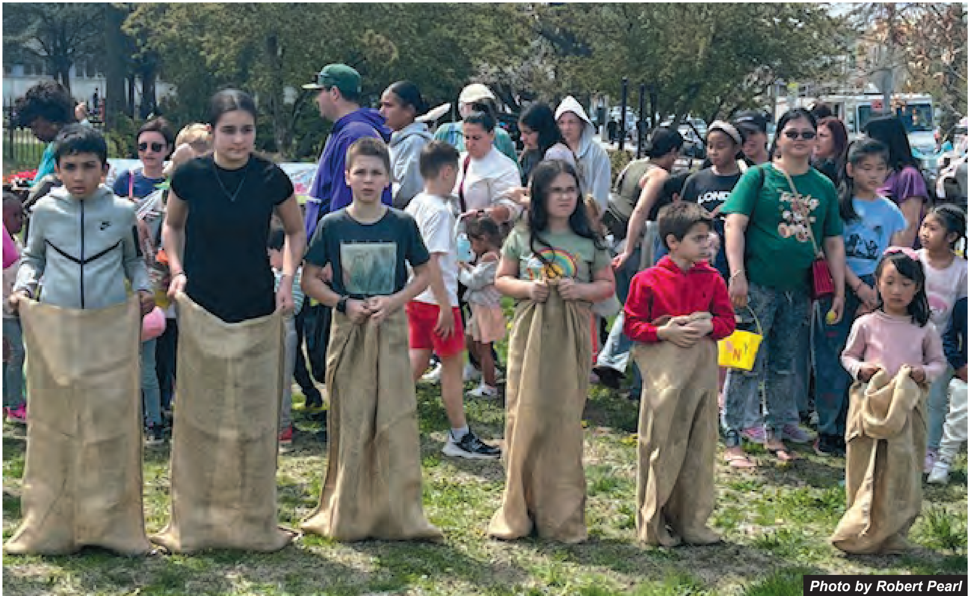
Story on page 18