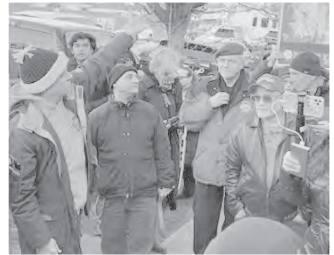
Curtis Sliwa marches with the crowd to the second lithium-ion battery site on Flatbush Avenue.