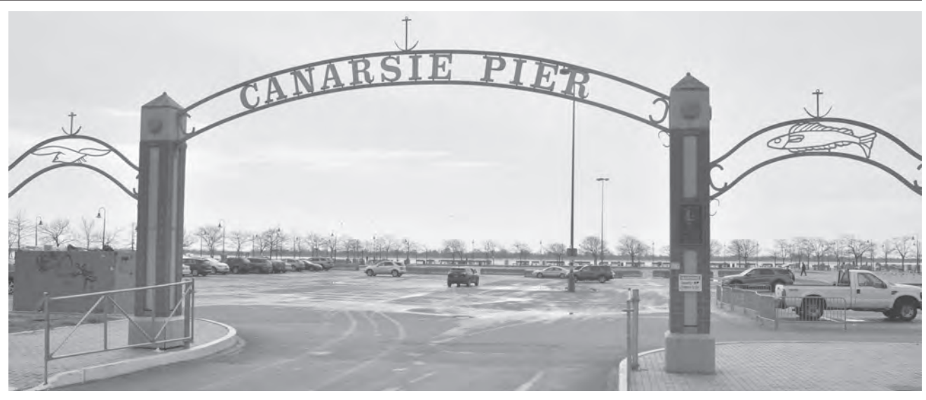
Canarsie regularly struggles with flooding, houses sinking and water leaks.