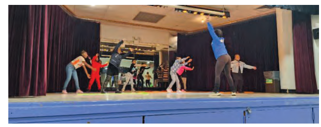
Children doing yoga.