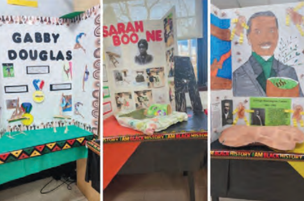
Black History Museum