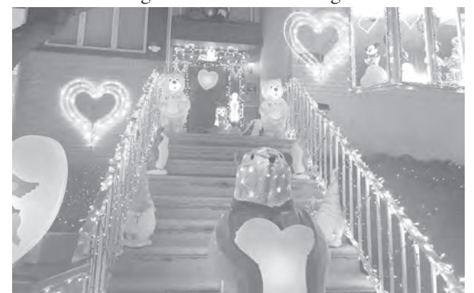
The decor travels up the front exterior of the house.