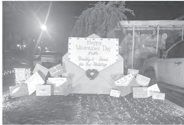
Love letters abound on the left lawn.