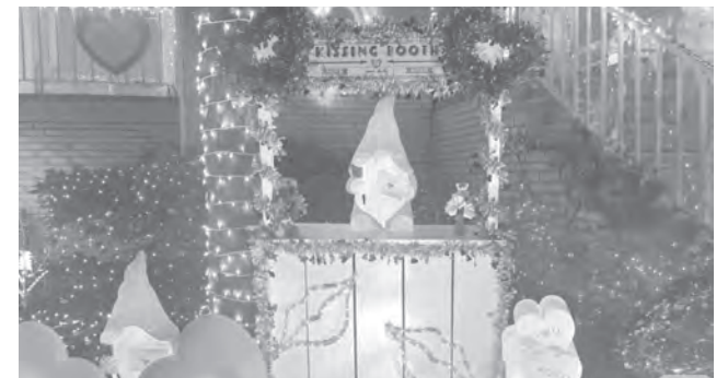
A little gnome mans his kissing booth.