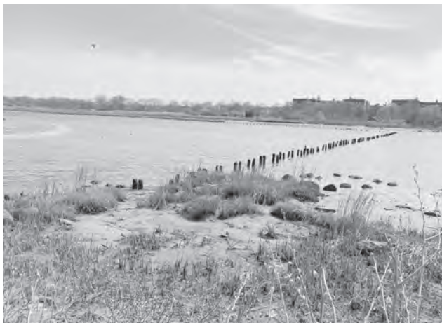
The Marine Park Salt Marsh was the site of many brush fires in fall 2024.

“We were fortunate to avoid any loss of life or any residential or commercial property damage, but these fires destroyed parkland and endangered the firefighters who responded to them,” he said. “We cannot afford to underestimate the threat of brush fires and the possibility they could become more dangerous for people and property in the future.”