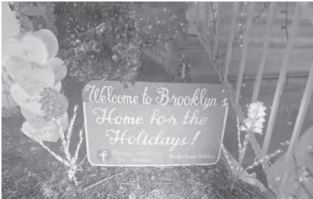
Brooklyn's Home for the Holidays decorates for all major holidays.

The Valentine's Day display will be up at 1102 East 72nd Street through Sunday, February 16th, and will be lit every night from 6 to 10 p.m. The next display, for St. Patrick's Day, will be up in early March.