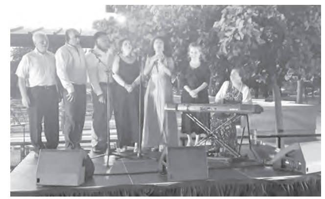
The Regina Opera Company performing at the Marine Park Concert Series on July 10th.

All concerts take place on the lawn near the bocce courts at 7 p.m. Bring a blanket, chair and your friends and family! For more information, call 718-252-2124.