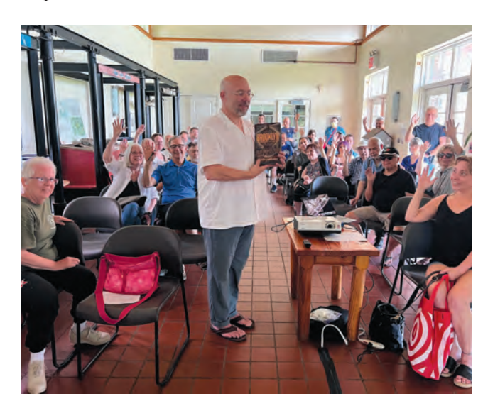
Raised hands indicate all the Marine Park residents who attended the event.

"He's quite down to earth," she said. "He's knowledgeable and he's accepting to other people's input, and the fact that he lived up by Cornell and yet he stays here still and comes back and forth is quite impressive."