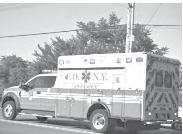
Paramedics arrive at Allen Avenue and Garland Court and pronounce the unidentified body deceased.