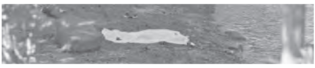
Officers from the 61st Precinct respond to the site where a person's body was recovered from Plumb Beach Channel on Wednesday, July 10th.

The cause of death will be determined by the Medical Examiner's office.