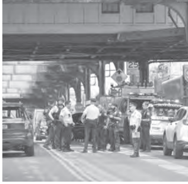
Officers from the 75th Precinct responding to an assault with barricaded suspect on Sunday morning, July 7th.

Anyone with information regarding this incident is asked to call the NYPD's Crime Stoppers Hotline at 800-577-TIPS (8477) or for Spanish, 888-57-PISTA (74782). The public can also submit their tips by logging onto the Crime Stoppers Website at crimestoppers.nypdonline.org/, or on X @NYPDTips. All calls are strictly confidential.