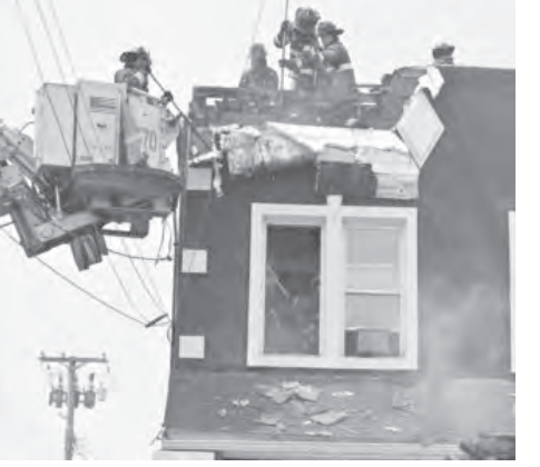
Firefighters put out a fire on the roof area of 112 Louisiana Avenue on Monday, July 8th.

East New York Firefighters Battle Roof Fire at Private Dwelling