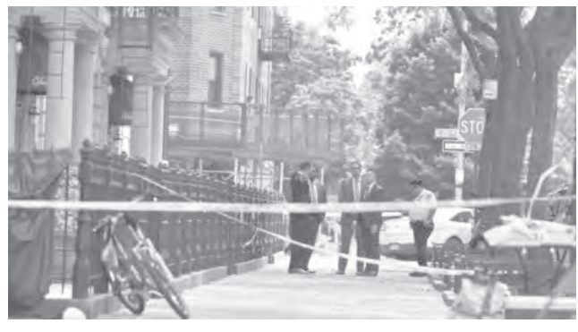
Detectives are investigating a fatal shooting that took place at 2126 Dorchester Road on Thursday, July 4th.