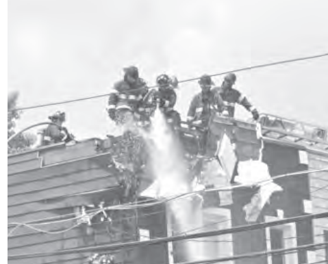
Engine Companies 257 and 290 working to extinguish a fire on the roof of 112 Louisiana Avenue.