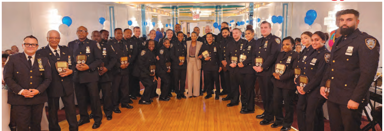
First Deputy Police Commissioner Tania Kinsella (center) flanked by 69th Precinct officers at annual Clergy Council Awards Dinner.