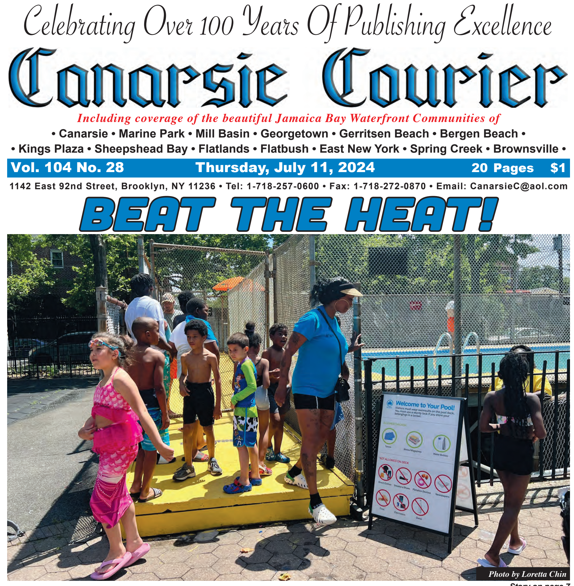
Story on page 7