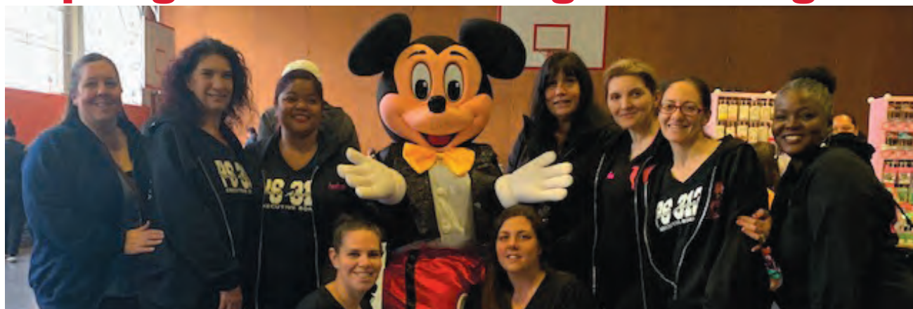
Parents Association team with Mickey Mouse