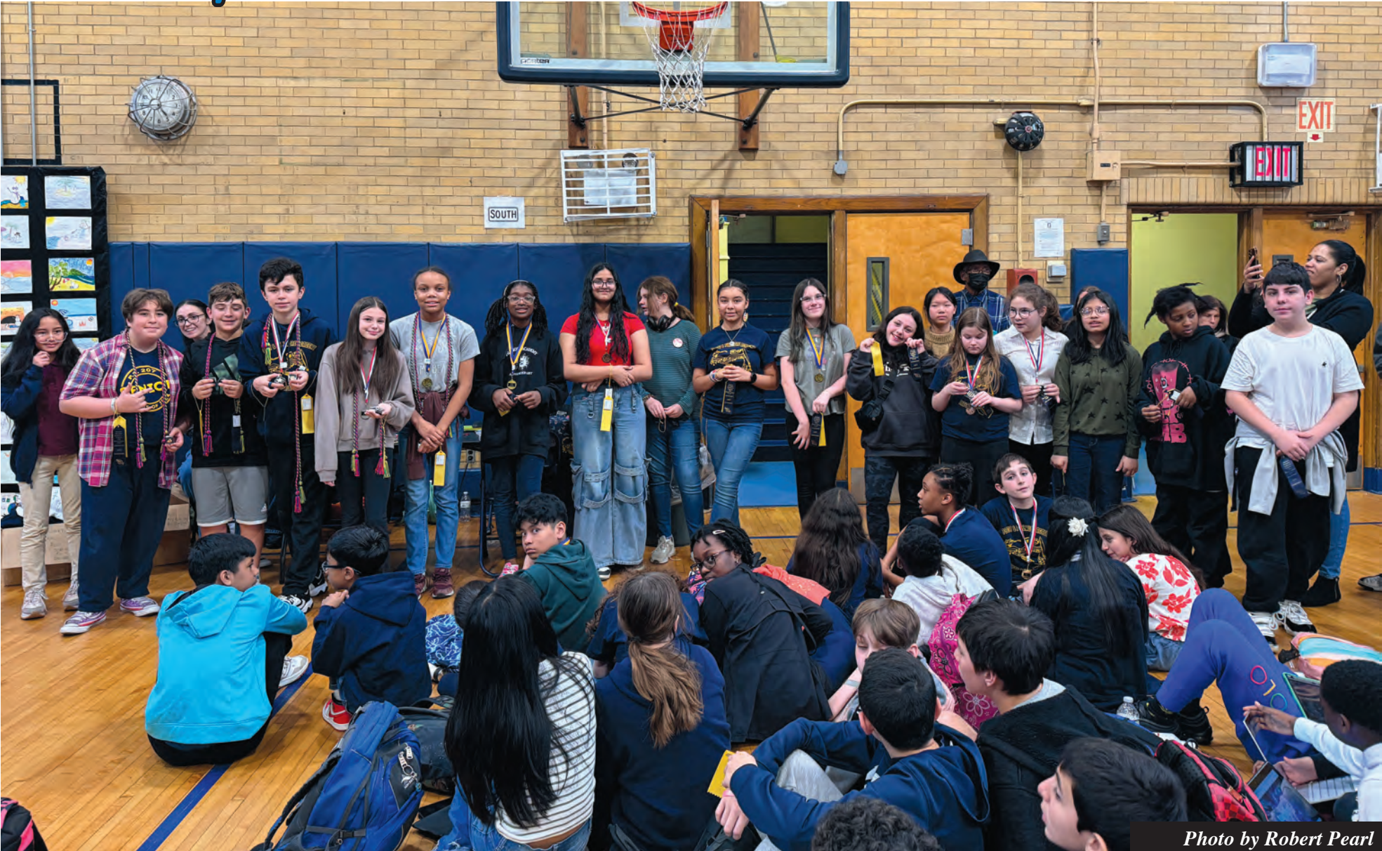
Story on page 13