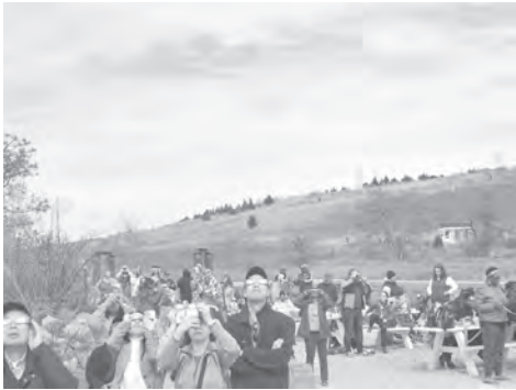
Viewers, using binoculars, look up to the sky at Hendrix Creek Patio in Shirley Chisholm Park.

Still, hundreds gathered at Hendrix Creek Patio in Shirley Chisholm State Park, 1750 Pennsylvania Avenue, for a viewing arranged by the NYS Department of Parks, Recreation and Historic Preservation. There, glasses were provided on a first-come, first-served basis, (starting at 2 p.m. and while supplies lasted) to those who weren’t registered to attend the viewing. And even when the glasses ran out, the Parks Department ensured everyone was accommodated with special binoculars and a telescope. The agency also arranged guided, solar eclipse trail hikes for those who preferred to experience the phenomena from a higher altitude.