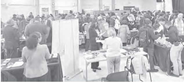
Job seekers inside the H.E.S. gymnasium.

Massive does not adequately describe the crowd that showed up for the job fair held at the Hebrew Educational Society (H.E.S.), at 9502 Seaview Avenue, on Thursday, April 4th. Over 90 companies and a staggering 2,500 job seekers preregistered for the event that was sponsored