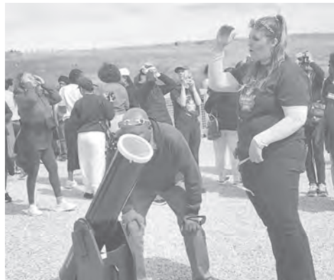
Viewers line up to see solar eclipse through telescope.