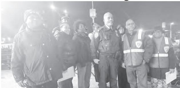
Members of the NYPD and 69th Precinct Clergy Council at a prayer vigil held on April 1st at Rockaway Parkway and Seaview Avenue.

Prayers were also said for the Nation and all elected officials and leaders.