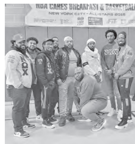
Members of Nu Omega Chi Fraternity.