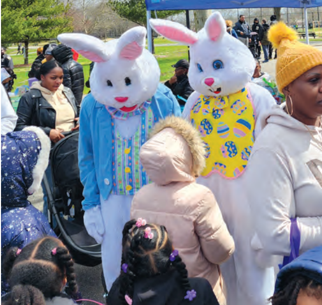
Easter Bunnies greet the crowd.