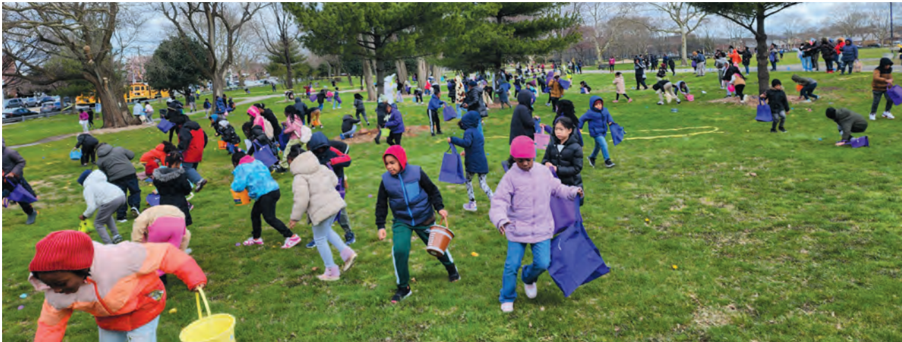
Easter Egg Hunt in progress.