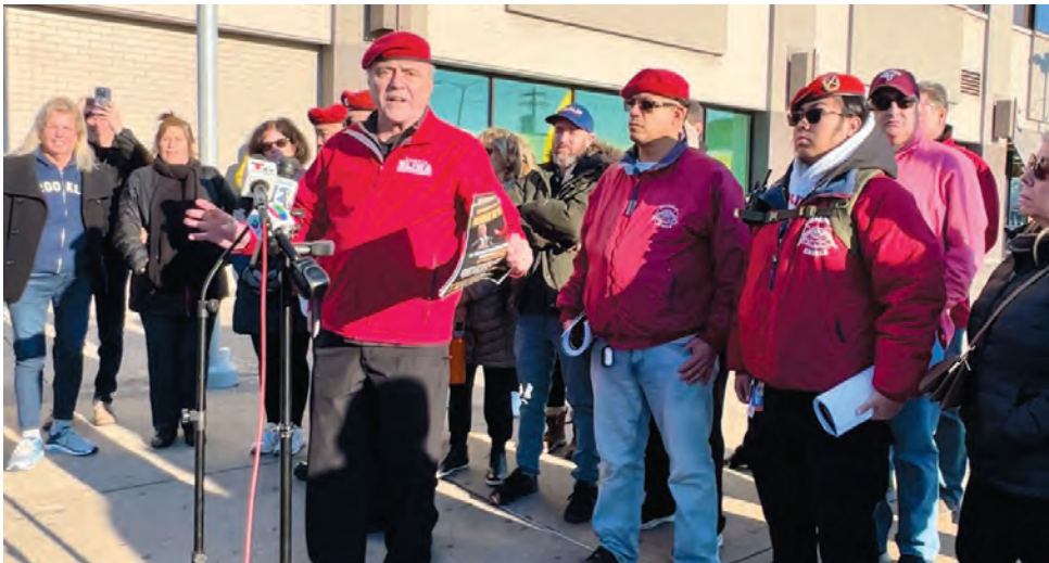
Curtis Sliwa calls for the permanent closure of the Floyd Bennett Field tent shelters.

A number of migrants watched from across the street at the bus stop as they waited for the bus to return them to Floyd Bennett Field and heard chanting to “close the border” as the crowd dispersed among the cars.