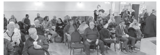
Meeting of the South Brooklyn Republican Club on January 10th.

The South Brooklyn Republican Club meets on the first Wednesday of every month at their headquarters located at 3051 Nostrand Avenue (Knights of Columbus) and is open to the public. Interested individuals can stay informed about upcoming events and speakers by signing up for their mailing list or following them on Instagram and Facebook @SouthBrooklynRepublicans.