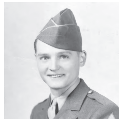
Technician Fourth Grade Service Company 747th Tank Battalion, U.S. Army.

Good Shepherd Church, Marine Park (1982 – 1986)