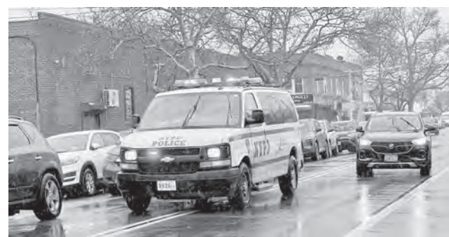
Police came out to issue tickets to double parked cars in front of residents' homes all along East 56th Street on Sunday.