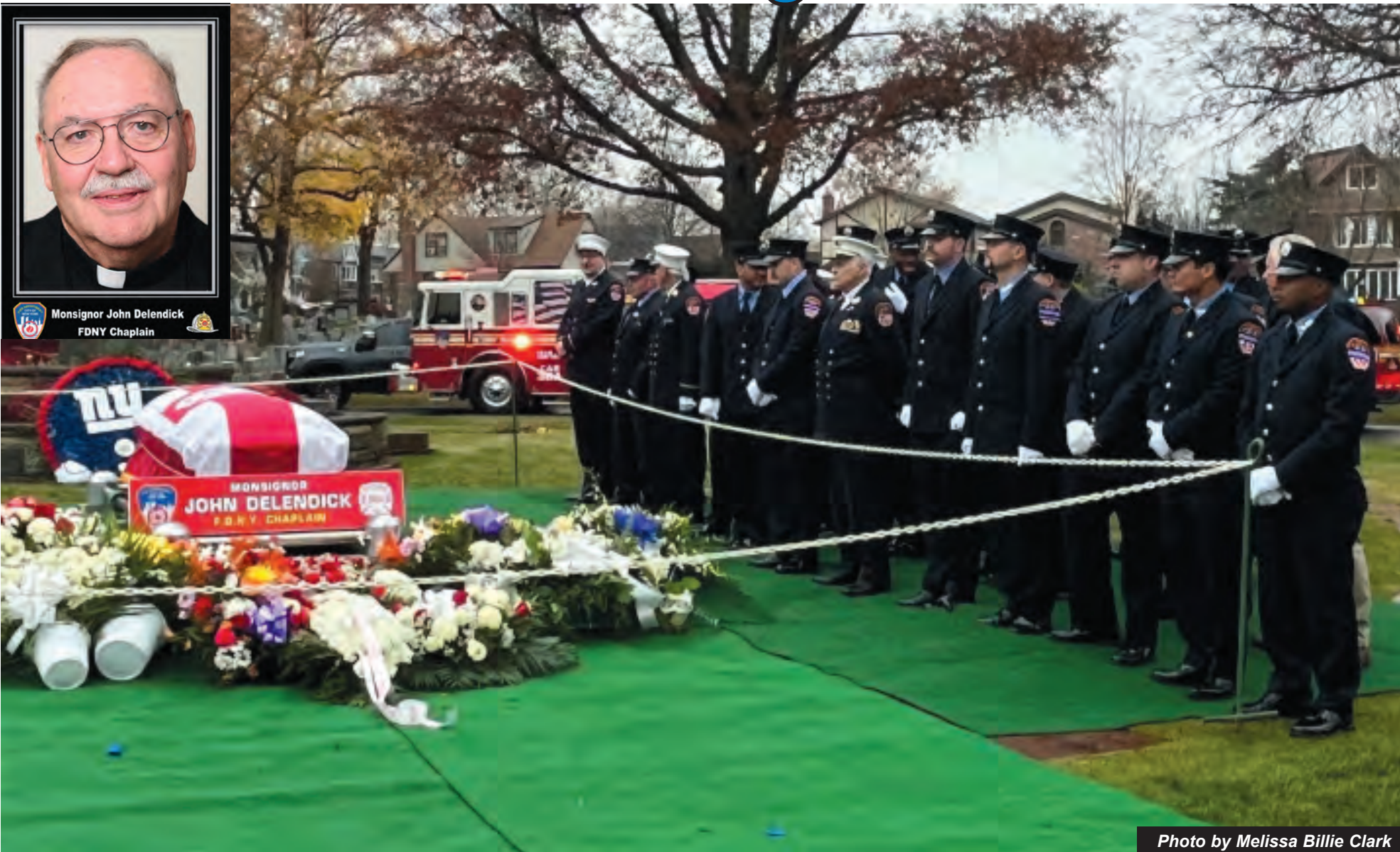
Story on page 14

See Our Hanukkah Supplement Starting on Page 18