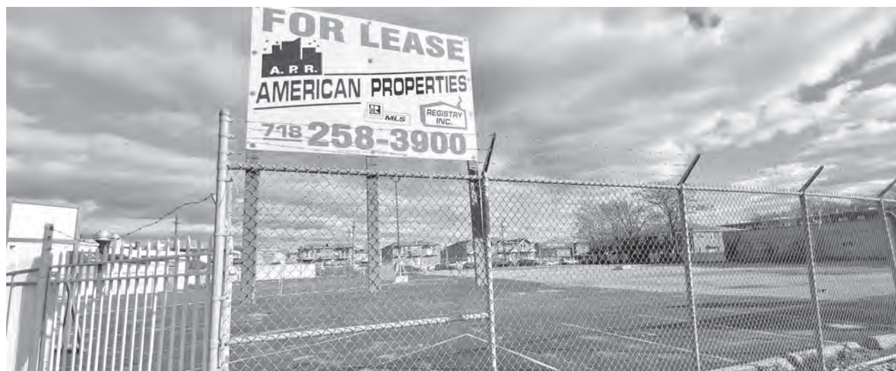
This vacant site at 5602 Flatlands Avenue could become the home of a seven-story building if the mayor’s disastrous “City of Yes” plan is approved.