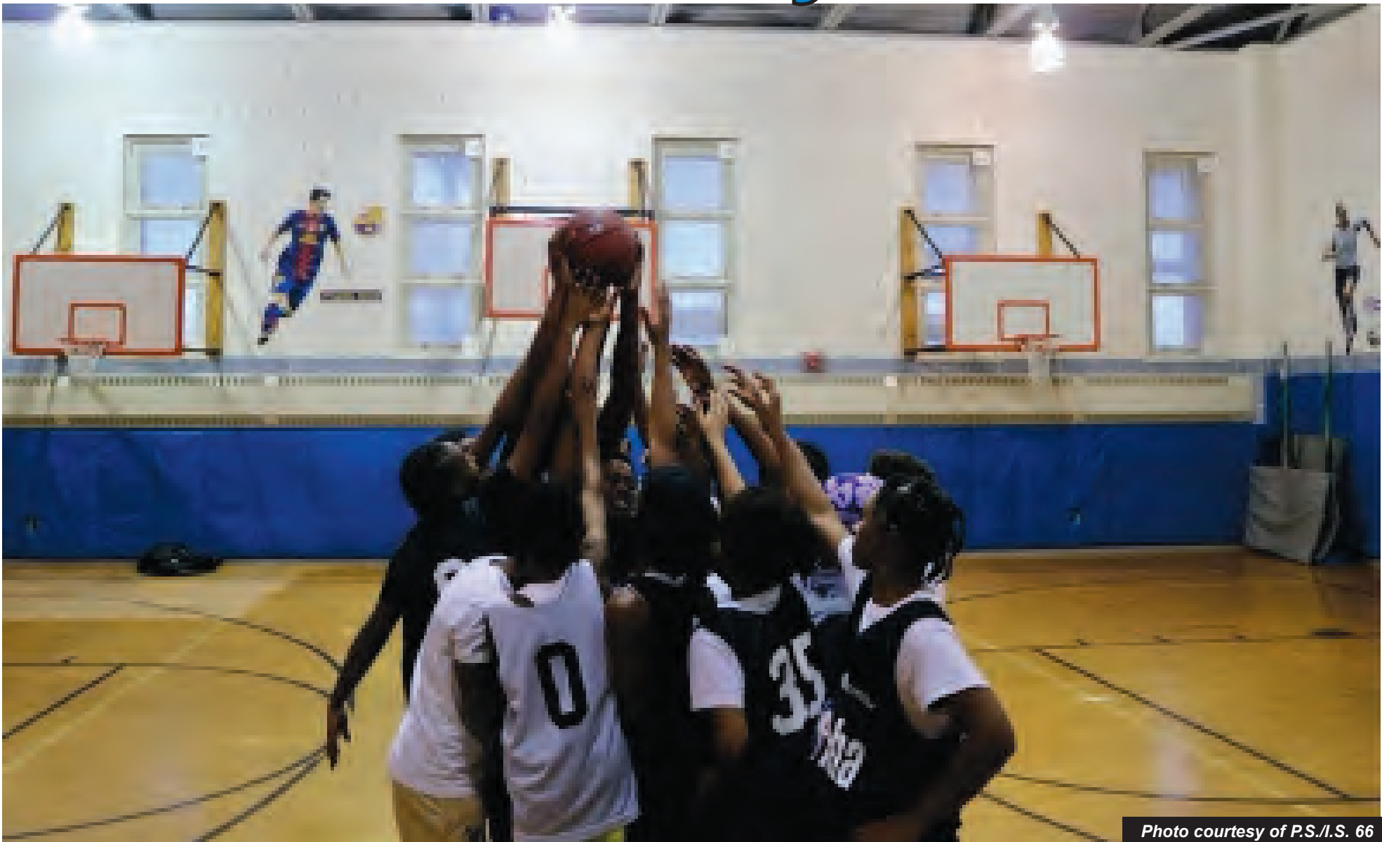
Story on page 6