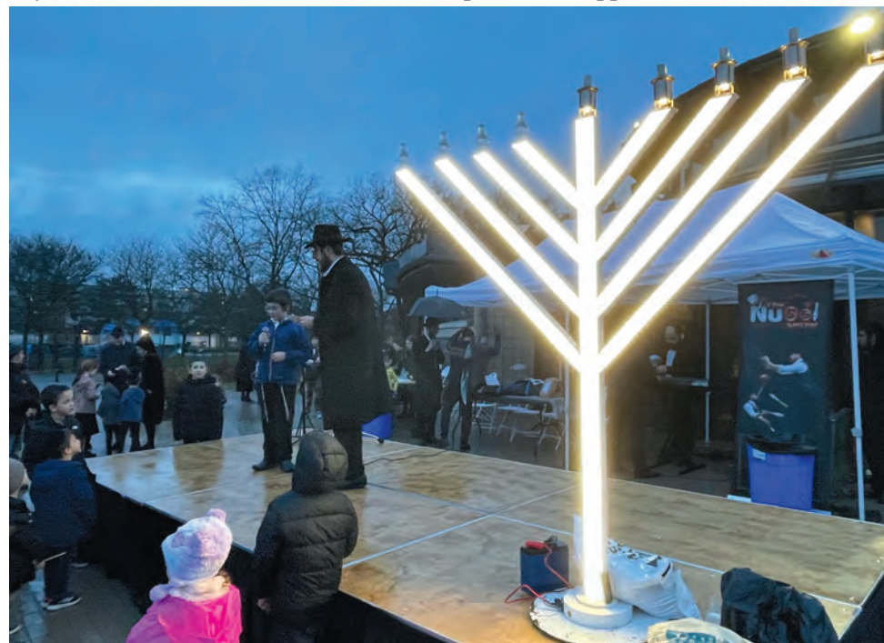
The celebration starts with the reading of a verse from the Torah.