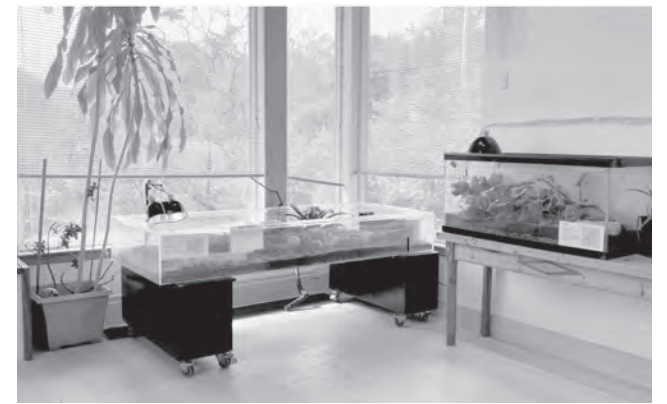
The Wet Lab, aka Discovery Room, is where you can say hello to Charlie the turtle and see a variety of exhibits used for classroom learning.