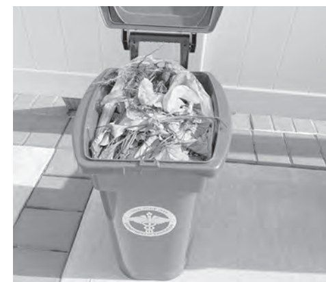
A bin on East 71st Street already filled to capacity in anticipation of the first collection.

The primary question most residents have is what exactly they should be composting; the labels attached directly to the top of the brown bins can help to demystify the process. Leaves, twigs, grass clippings and yard waste may be placed in the brown bins, as well as coffee grinds and filters, tea bags, ALL leftover food, bones, peels, shells, soiled napkins, paper plates and pizza boxes. To learn more, visit nyc.gov or call 311.