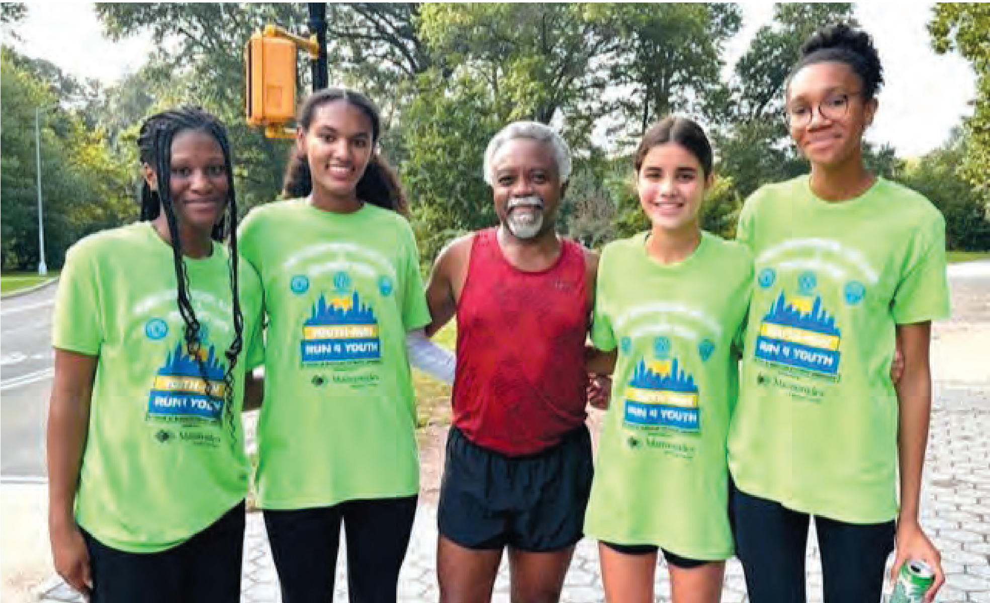
Story on page 2

We will be closed on Monday, October 9th in observance of Columbus Day.