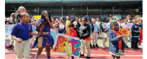
"Peace" — the message on this K-105 class banner.

"What do we want? Peace! When do we want it? Now!!," chanted students and their teachers as they raised their banners and marched for global peace.