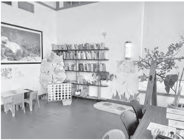
The Arts and Crafts room is a Kids Zone filled with books, games and activities for children.

taining two snakes, an Eastern Box Turtle named Charlie and exotic roaches. The rangers teach nature programs to school groups there.