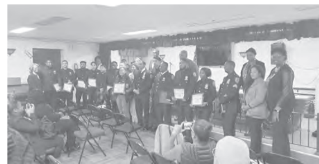
69th Precinct officers holding Cop of the Month awards for June, July and August.

The next meeting of the 69th Precinct Community Council will be held on Tuesday, October 24th at St. Alban's Church.