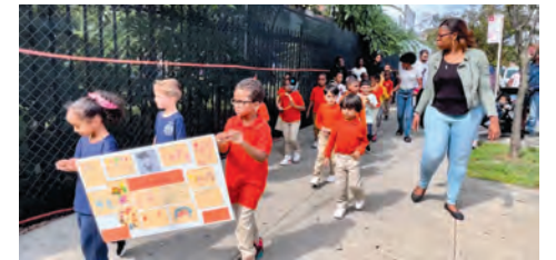
K-101 chose Confucius as their featured peace builder for their banner.